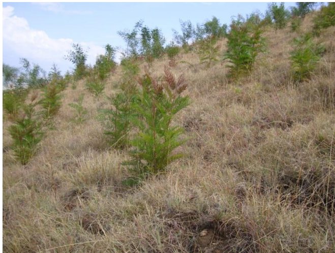
2009 January, strong growth