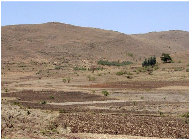
2006 May, eroded hill range

Since 2007 we do afforest these hills and we have even expanded the activities to neighboring peasant associations.