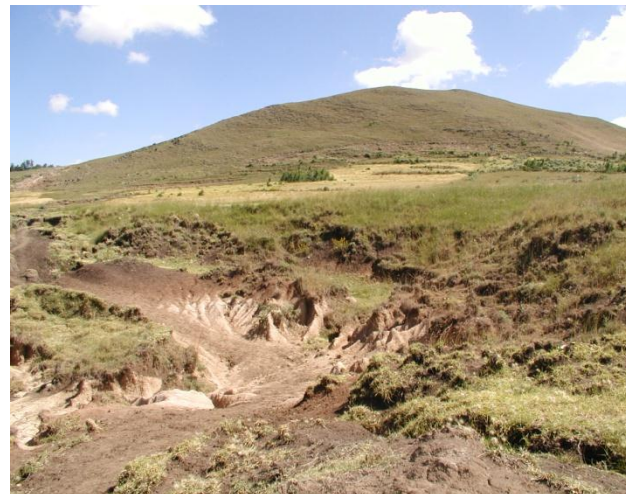
2006 November, destroyed cultivated land at the bottom of the hill, caused by water runoff