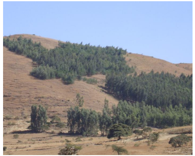
2011 February, a forest develops