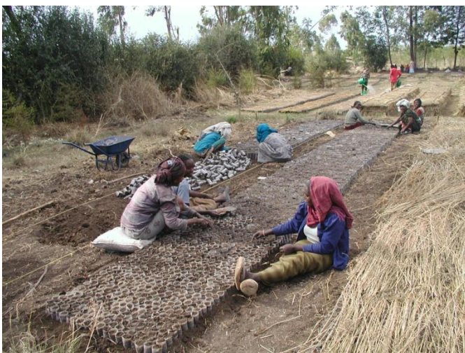
2007 April, seedling production at the nursery in Dukem