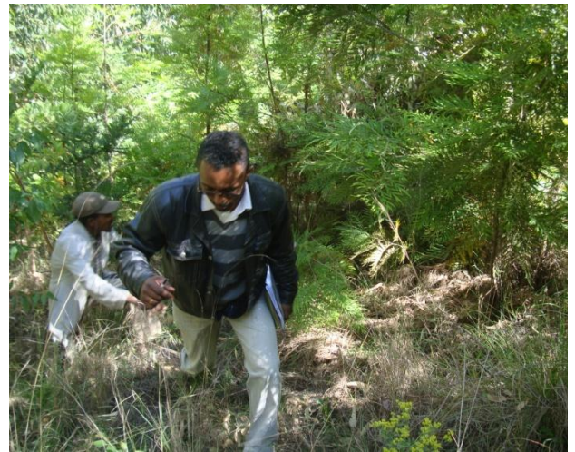
2011 October, a government official is surprised about the changes possible within a few years only