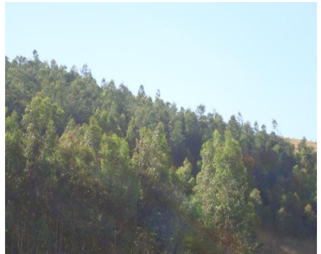
2011, October, our forest

The afforestation at this hill is an example and is widely used as model. At the bottom of the hill 3 fresh water springs evolved, allowing people to find water for their own consumptions as well as for their cattle close to their homes even during dry season. Neighboring peasant associations have started contacting us to extend afforestation into their villages.